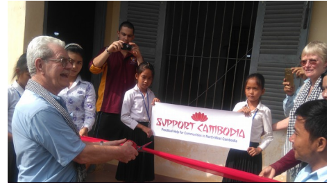
2016: Opening the Solar Panels at Phnom Priel