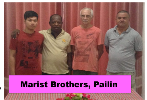
Marist Brothers, Pailin

Our learning center is closed since the beginning of the pandemic, but the government is contemplating opening schools in stages, Universities [August], Secondary/High School [September] and Primary Schools [November]. However, our donors are no longer in position to support us ...we have had to pay our teachers and our other expenses from money set aside for building projects. Lavalla Boys Hostel is completed and furnished but we still need $45,000 to complete the girls' accommodation."