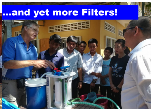
...and yet more Filters!