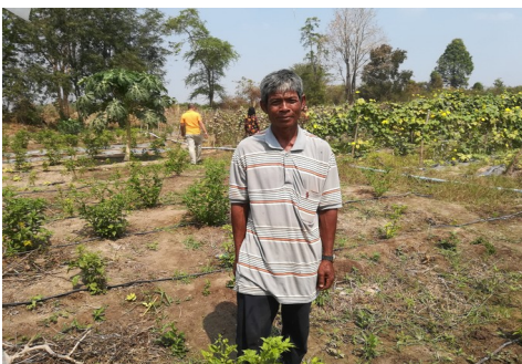
Microfinance Farming [Pailin]