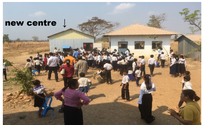
Kon Damrai Day Care Centre [Pailin Province]