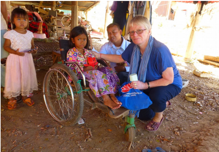
Wheelchairs in Banteay Meanchey