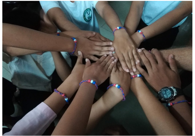
Friendship bracelets – Svay Sisophon