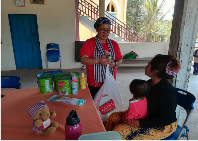
Baby Milk programme – Anlung Sa