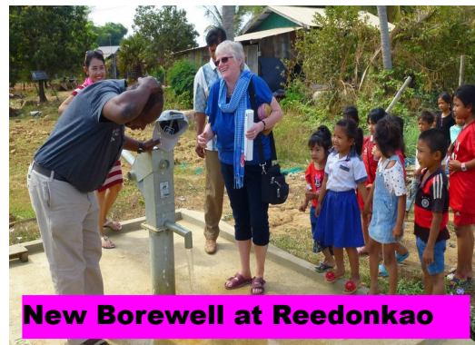
New Borewell at Reedonkao