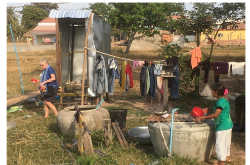
New toilet at Chomcatamau