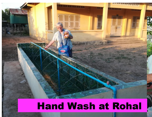
Hand Wash at Rohal