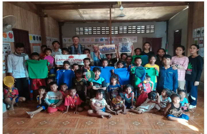
T-shirts at Pongro Day Care Centre