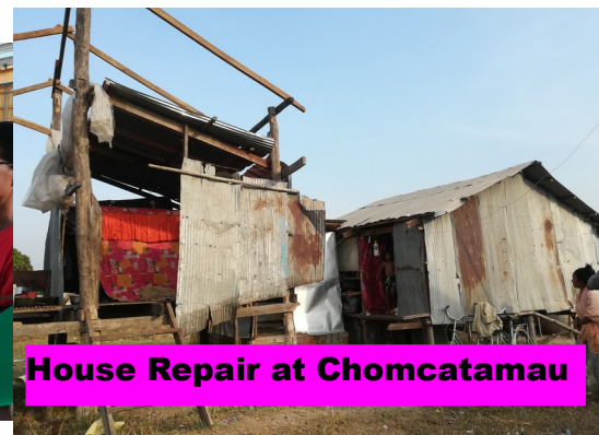
House Repair at Chomcatamau