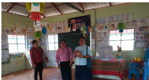
Kon Damrai Day Care Opens