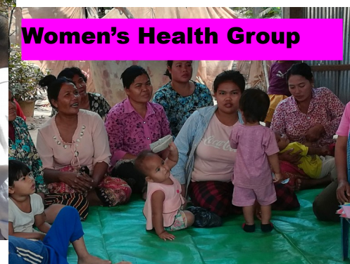
Women's Health Group