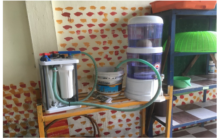
How to use a Community Water Filter!