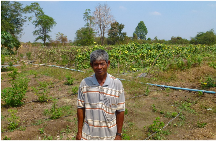
Pailin Microfinance scheme is going well