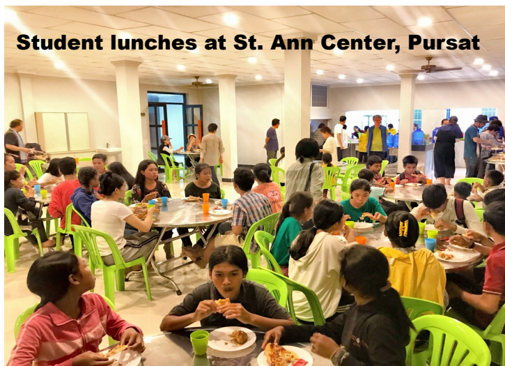
Student lunches at St. Ann Center, Pursat