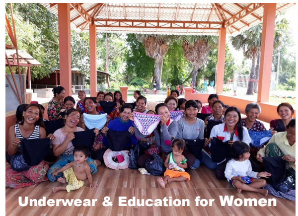
Underwear & Education for Women