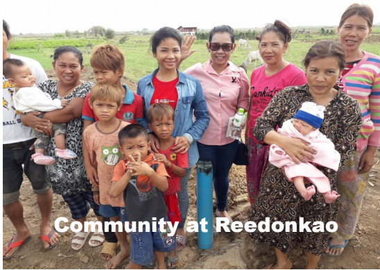
Community at Reedonkao

PROJECTS SINCE MARCH 2019.....read about them on PAGE 2