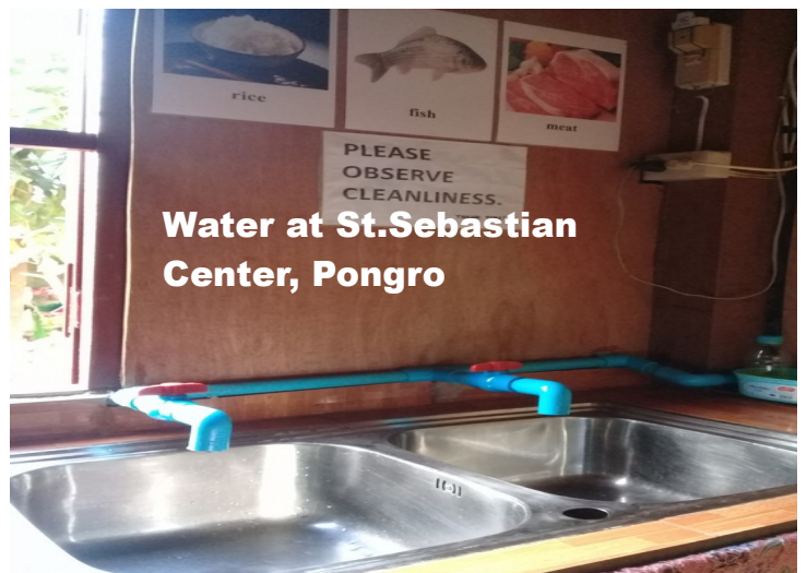
Water at St. Sebastian Center, Pongro

PLUS: WHEELCHAIRS ...RACE NIGHT P2 FROM THE TRUSTEES.....BAGS, BAGS, BAGS P3 INFORMATION/DIARY.....P4..... GALLERY[e-edition only] P5