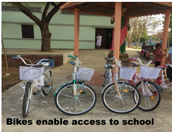
Bikes enable access to school