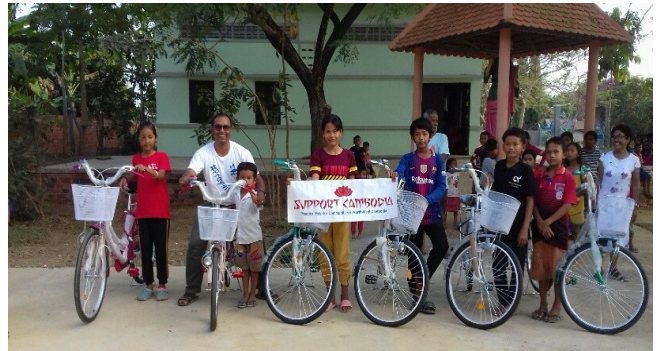
Bikes at Nikum Village