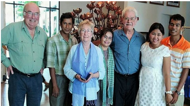
Trustees with good Friends