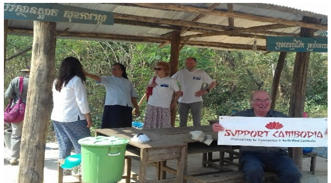
Kitchenette at Day So Primary