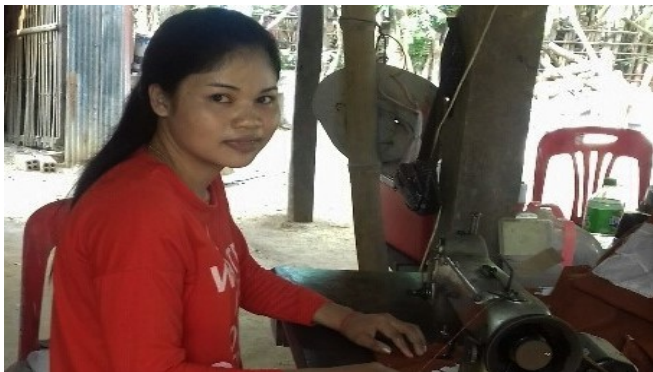
Sewing Machines at Rohal